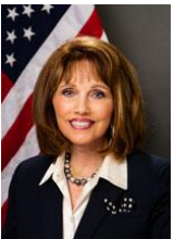
Remarks The Honorable Patricia Bates Senator, Minority Leader